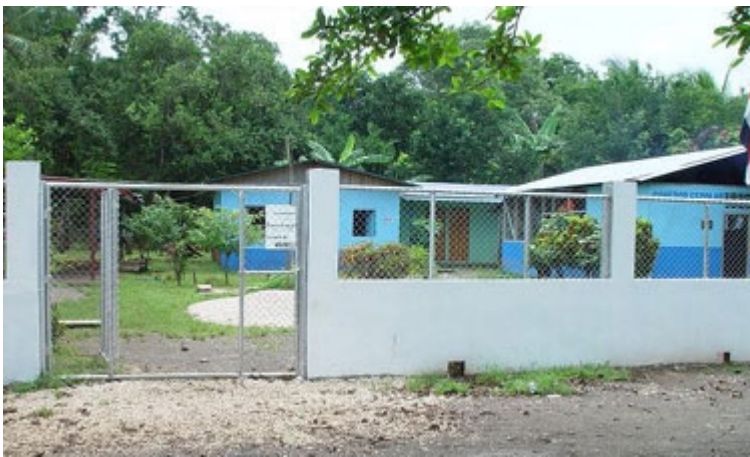
Above: Marbella school before the arrival of the playground.

with a fundraiser to build a playground (swings, slides, monkeybars... the whole works), to keep these adorable children entertained, active, and safe from not-too-distant pressures such as drugs or violence." Two months later, the funds were in and the building materials en route. Craig then organized members of the community and school to help put together the playground set. The following is a series of photos documenting the progress of the project. All captions are written by Craig.