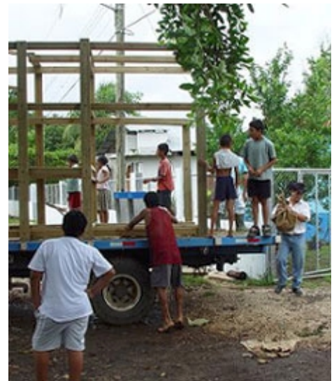
Above: The playground survived the long trip from San Jose, across deeply-rutted dirt roads, and through rivers on the back of this small flat-bed truck. With recent rains and the doubts of the truck's drivers of making it through the swollen rivers, it was quite a relief when the truck slowly clattered into town. The kids immediately reacted with frantic excitement, begging to help in any way they could.