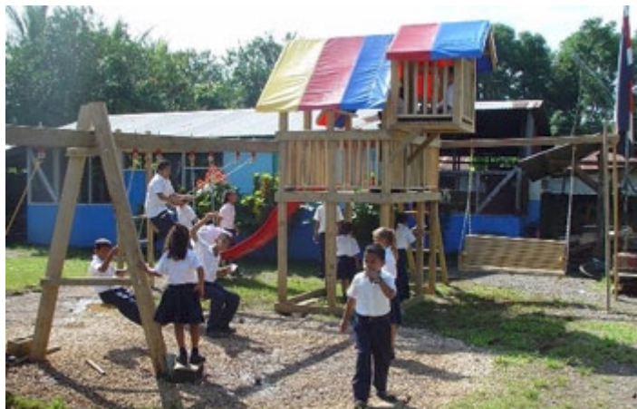
Below: The finished product.