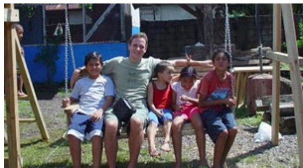
Below: Teacher and students after a long, hot afternoon wearing in the playground.