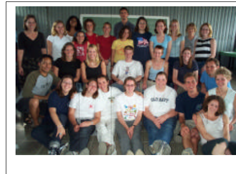
2003 Costa Rica Volunteer Group