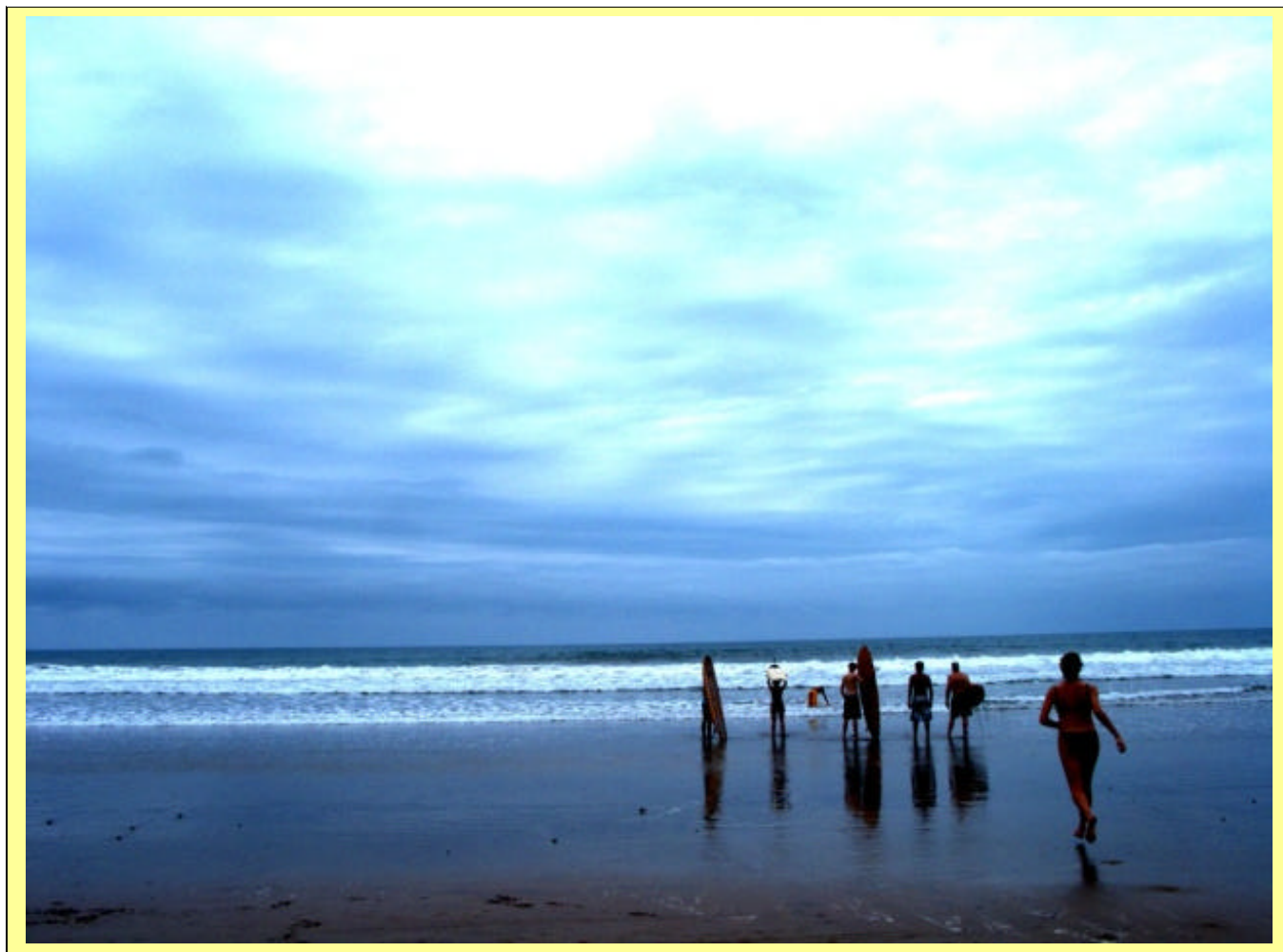
WorldTeach Ecuador Volunteers Hit the Beach