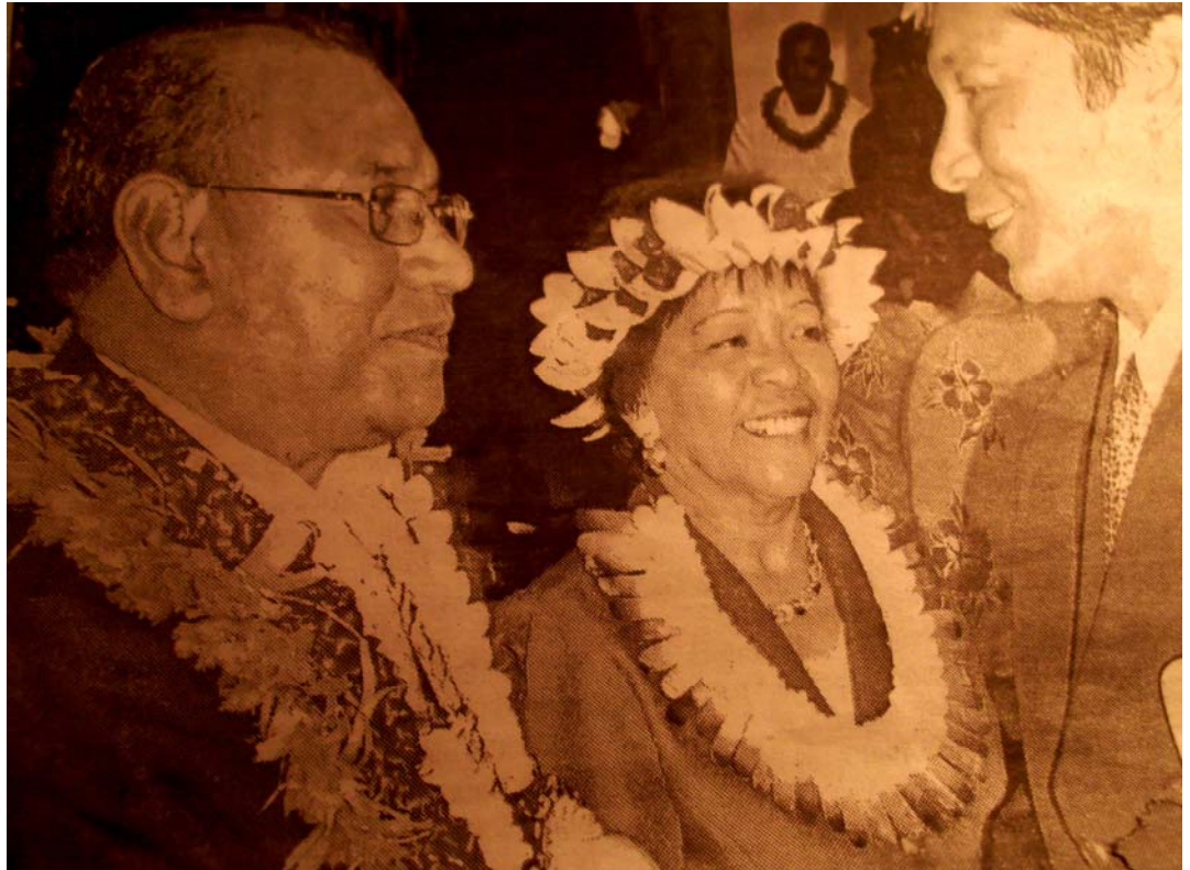
This photo of Christopher Loeak is from The Marshall Islands Journal.

The general election for the Nitijela seats and all the local government seats took place on November last year. There were new senators as well as new council members. Mr. Christopher Loeak was elected as the new President of the Marshall Islands by a majority of the Senators. He is doing well considering the fact that he is new to the post.