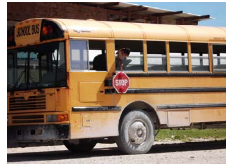
The addition of a new school bus will help transport students from Ebeye to Gueegegue on the causeway and help the school day start at more regular times.