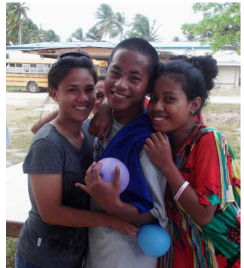
Members of the Health Club use their weekends to do good around Ebeye.